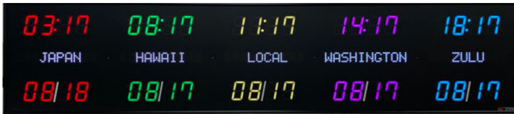
Model 6613H - 2.5" bar segment time & date, 1.2" zone labels, 5 zones